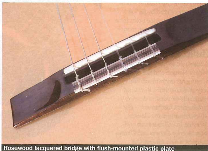
Rosewood lacquered bridge with flush-mounted plastic plate

Overall: A professional package at less than professional prices.