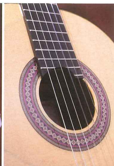
Solid spruce top with a UV varnish

“The first thing that grabbed me about this guitar is how mature it sounds for something so new.”